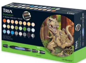
Illustration Item Number: TRCILLU UPC: 801199014966