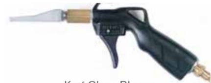
Kerf Clean Blower Nozzle