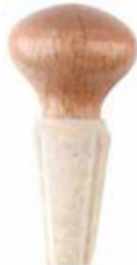
Spindle Taper Cleaner