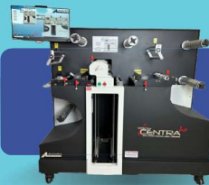
iTech Centra HS Finisher Speeds up to 30 feet/min and widths from 5" - 14"

CUTS ANY CUSTOM SHAPE OR DEPTH ON DEMAND