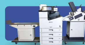
SnapPress LV-1-E for the Epson Workforce

QUICK DETACHMENT FEED BELT UNIT ALLOWS EASY ACCESS, CLEANING, AND MAINTENANCE