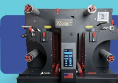
Axxis XL Plus Finisher Speeds up to 20 feet/min and widths from 4" - 8.5"