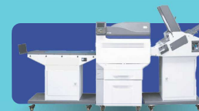
SnapPress LV for the Oki C900